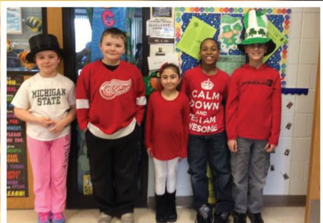
1 Salk Elementary kicked off the month with Dr. Seuss Week. Pictured is Top Hat Tuesday.

Throughout the month of March, students in Fraser Public Schools are celebrating March is Reading Month with a variety of fun activities. From special guest readers to exciting class projects, Fraser's students love this month's activities centered on reading. Here are just a few highlights from the month: