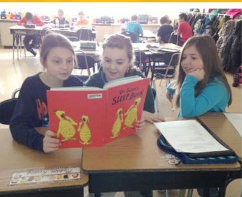
3 Twain Elementary students love reading together. What is better than sharing your favorite book with friends?