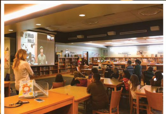
2 Edison Elementary students met the author of the book Mud Hole through Distance Learning.